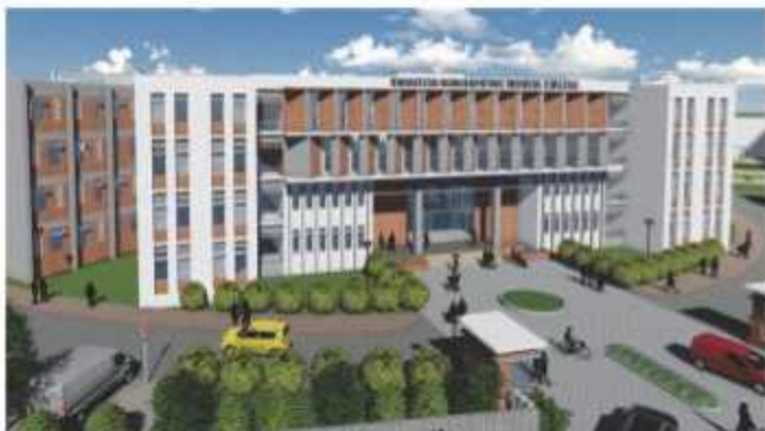
◀ CHANDRAGIRI CAMPUS Kudachi