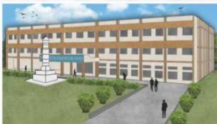
VINDHYAGIRI CAMPUS ▶ Halaga