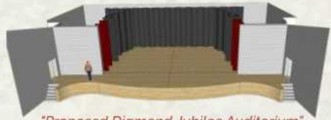
"Proposed Diamond Jubilee Auditorium"

Most significantly, it contributes towards realizing a much needed project of Bharatesh Education Trust, viz. the construction of a Diamond Jubilee Auditorium for the benefit of students and the community at large.